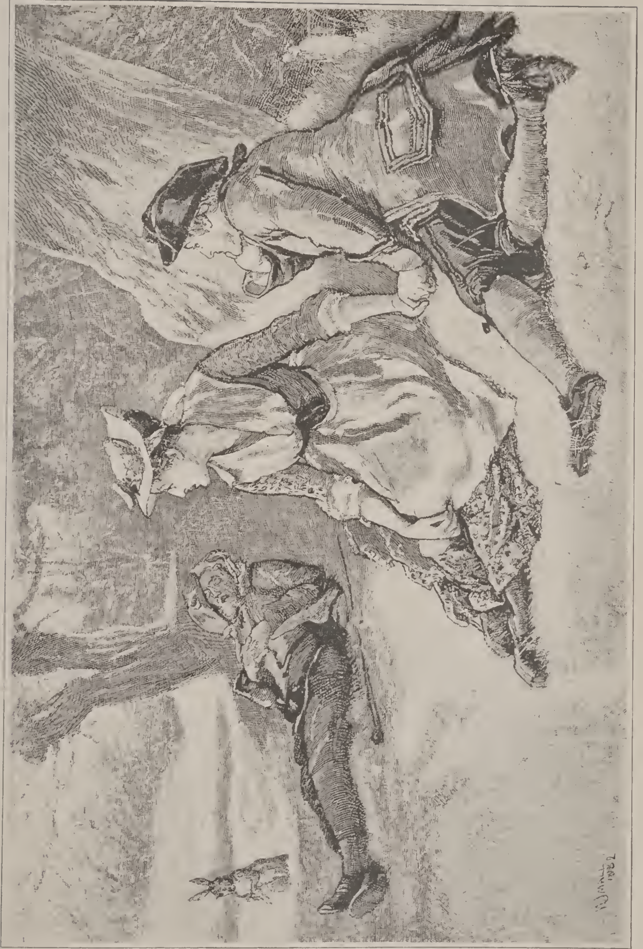
..The hare was no sooner on shore, than it seated itself on its hinder legs..